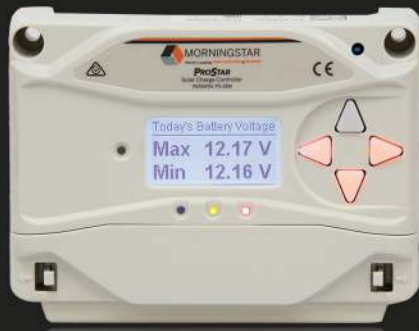
ProStar (Gen 3) Shown with optional meter